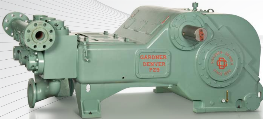
Standard Drilling Pump Configuration shown. Other motor configurations available.